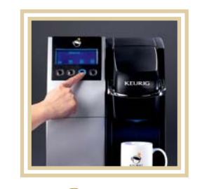
Step 3. Select one of four cup sizes and press the button