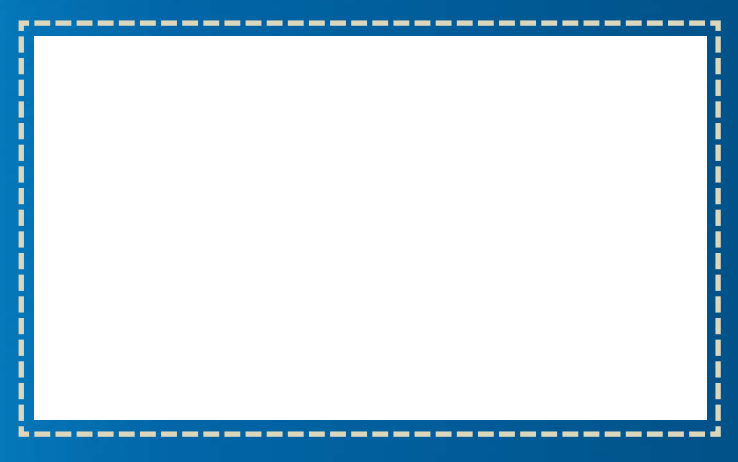
Ask your authorized distributor for more details

LCD Screens above are graphically simulated